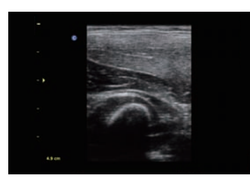
Elbow Joint, B Mode