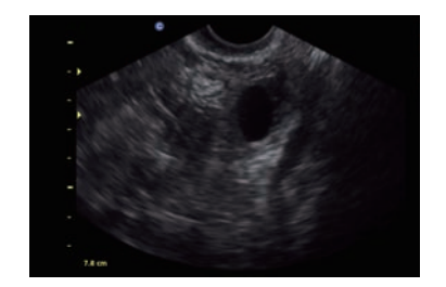
Follicle, B Mode